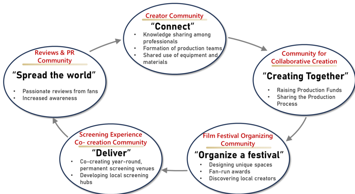
[Figure3] The Big Picture of Value Circulation Through the Building of Multiple Communities

Through this pilot project with Visual Voice, we aim to leverage technology to strengthen connections among creators and between creators and their fans, with the goal of establishing a model case for a new creator economy in the content industry.